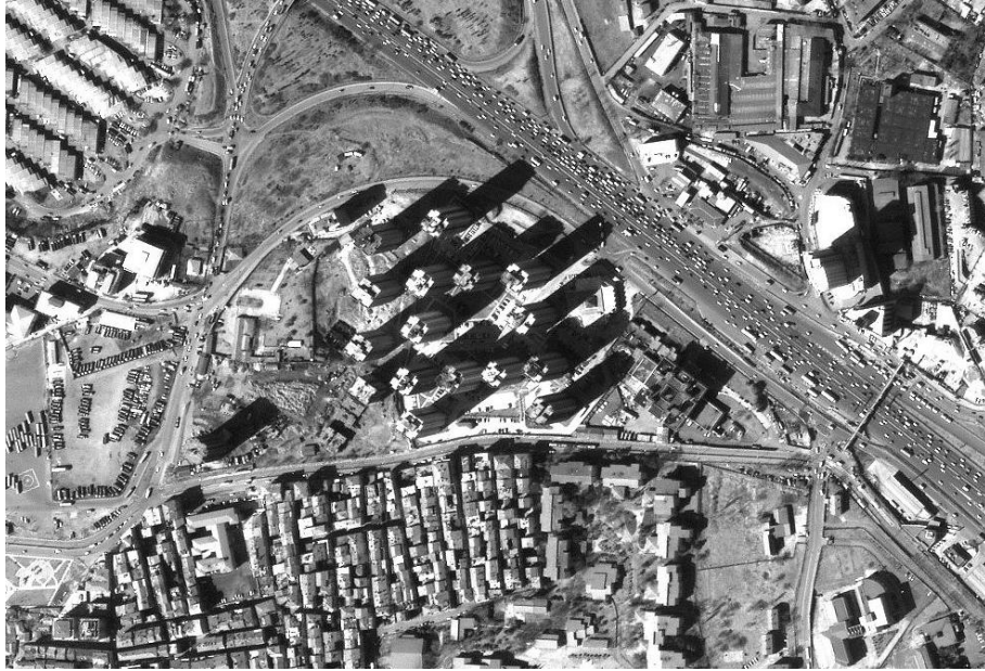
Figure 3: Subimage of ikonos A: high buildings leading to huge image displacement, long shadows and occluded areas.