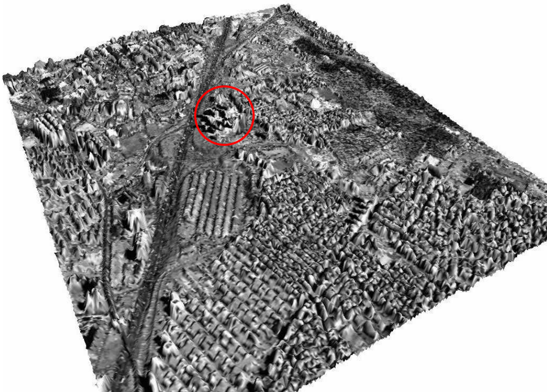
Figure 4: Part of drupe created out of along-track stereopair. Due to big image displacement of the buildings shown in figure 2, mismatches lead to errors in the DSM. From a theoretical point of view, redundant information from a third image could reduce this error