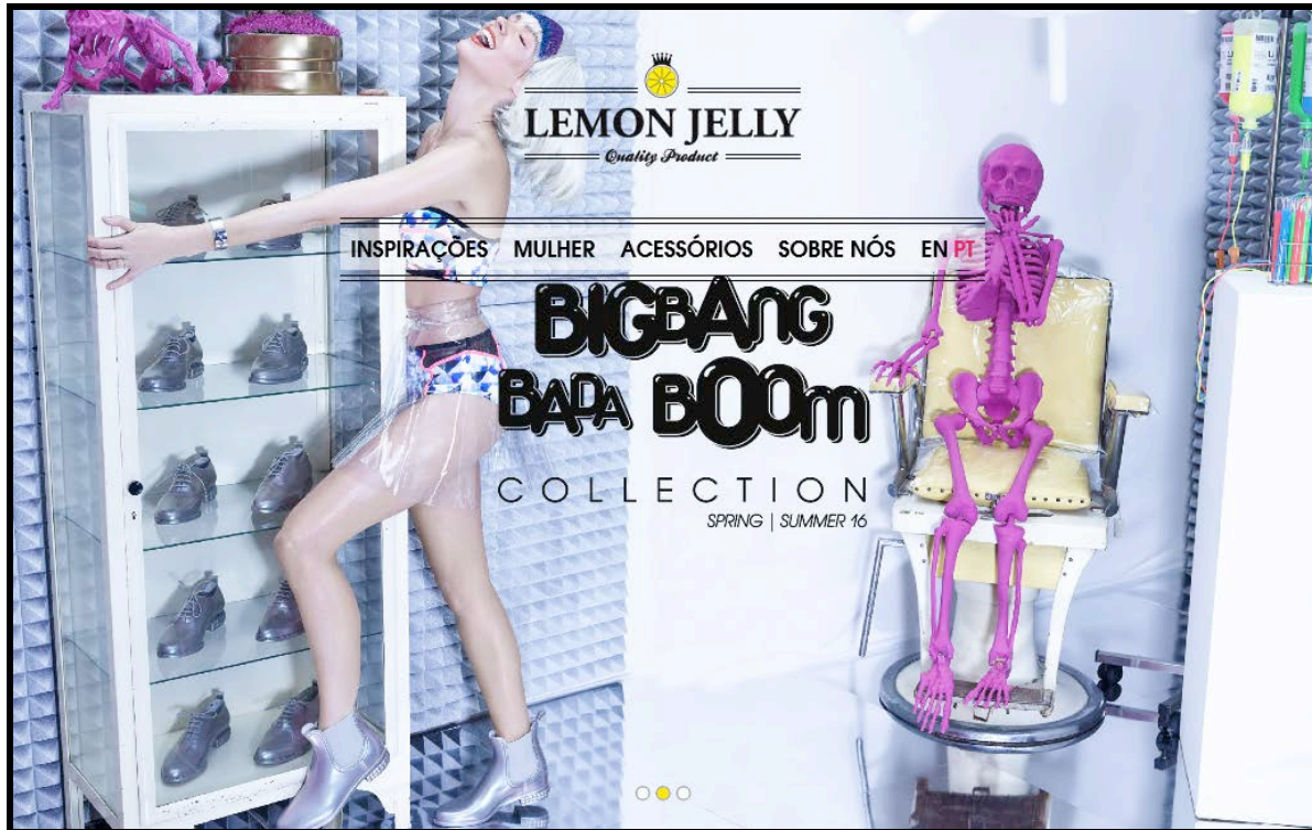
Figure 2: Website of Lemon Jelly (accessed at 17 th of May 2016)

In 2013 Procalçado have begun a new adventure. Starts with a fashion injected footwear project, associated to a new concept and brand: Lemon Jelly. Lemon Jelly is one of the emerging brands of the footwear sector in Portugal, which already received several innovation awards, since 2013 (Fig.2).