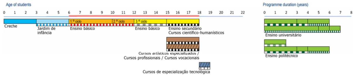
Figure 1: Structure of the Portuguese School System 15

The Portuguese school system offers opportunities for non-traditional students through a range of alternative options, which provide a second opportunity to those individuals who left school early, who are at risk of doing it or who want to acquire further qualifications at the school level, especially those in the labour force. Several training alternatives are available: