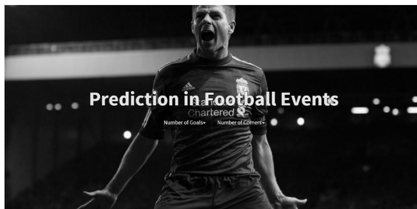
Fig. 3. Prototype

The generated prediction is then sent to the web platform to be used by the better. In Fig. 3 is the prototype main menu.