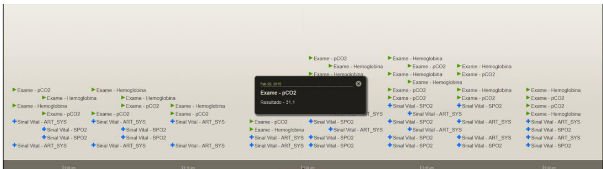
Fig. 2. Patient Timeline.

Below in Fig. 2 it is possible visualize a simple example containing a few variables about a patient's results concerning vital signs and exams from data collected in the ICU of CHP. In this example it is possible to observe data from a date (February, 20, 2015), a short period of time (15 in 15 minutes) and two types of data sources (LAB (green) and VS (blue)). By clicking on the variable is possible to verify the patient value. In other cases it is also possible to automatically show the variables values, it depends on the way of the intensivist wants the information.