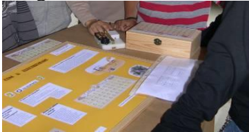
Figure 3 - Students explaining the Telegraph

friends during the development of the projects during this year. The opportunity of see the work that students made last year and the appeal to encourage and help them to participate made that parents and friends become an important help on this project. As an example, we have the first prize from a group of four students of 5 th grade that explain how to work an telegraph, that we can see on Figure 3.