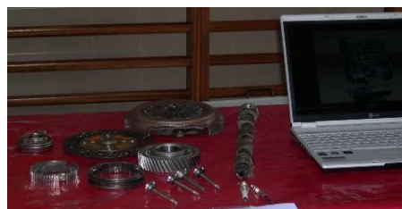
Figure 2 - The peaces of the break system of a car Curiously, this kind of project made a great success between students.

When we make the final analyze of the fair we conclude that this year we had what we call 4 non experimental projects. These projects didn't have with base experiences that permit to explain or test any factor. They simply explain how some things work. As an example we have the project of two students from the 7 th grade that explain the clutch system, as is possible to see on Figure 2