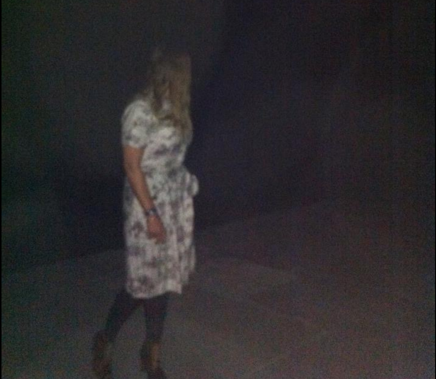
Audience member inside installation, a darkened space approx. 5 x 8 m in dimensions