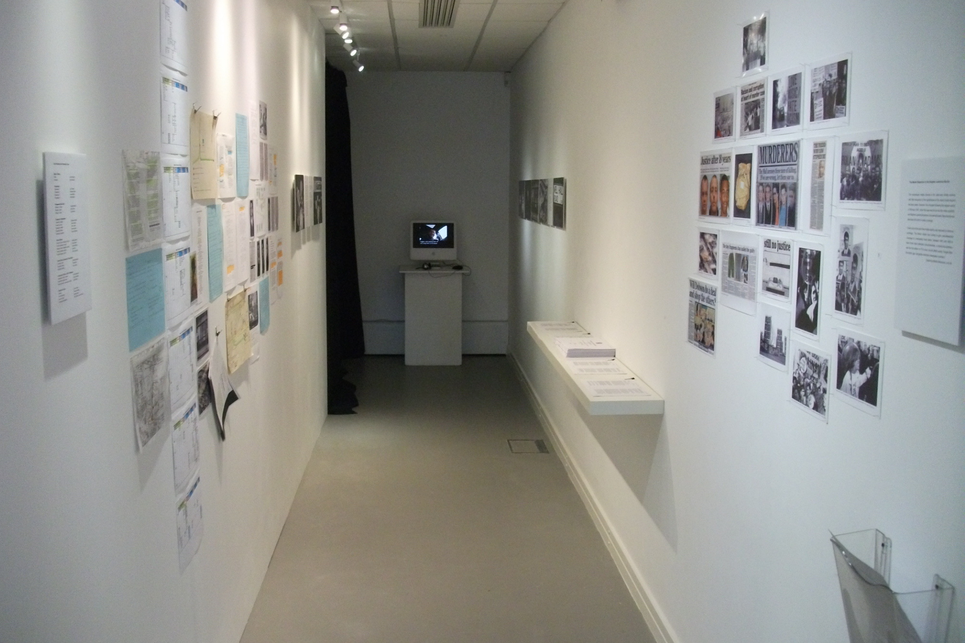
Accompanying visual display available as part of the exhibition