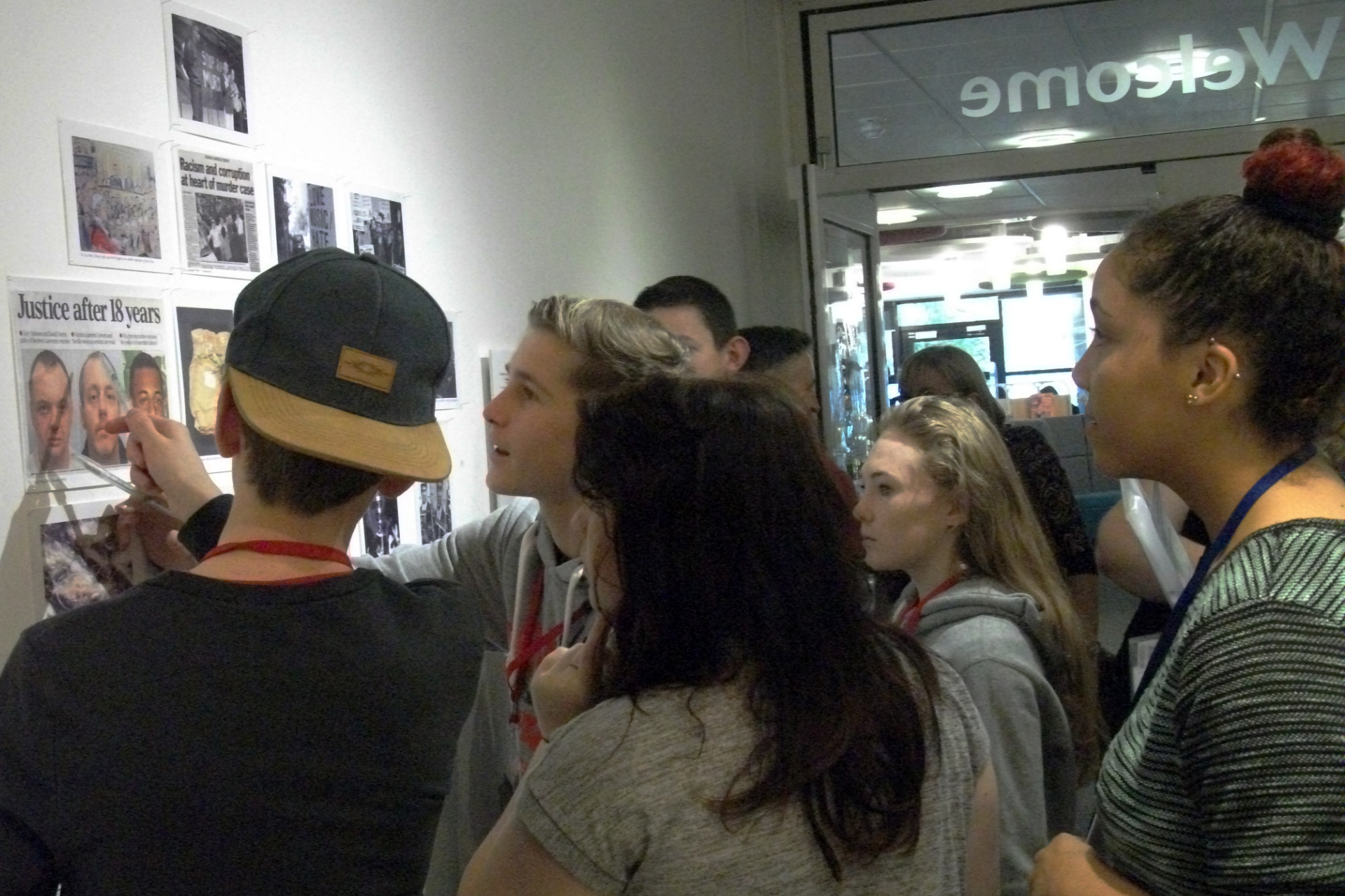
Students viewing and discussing the accompanying visual display