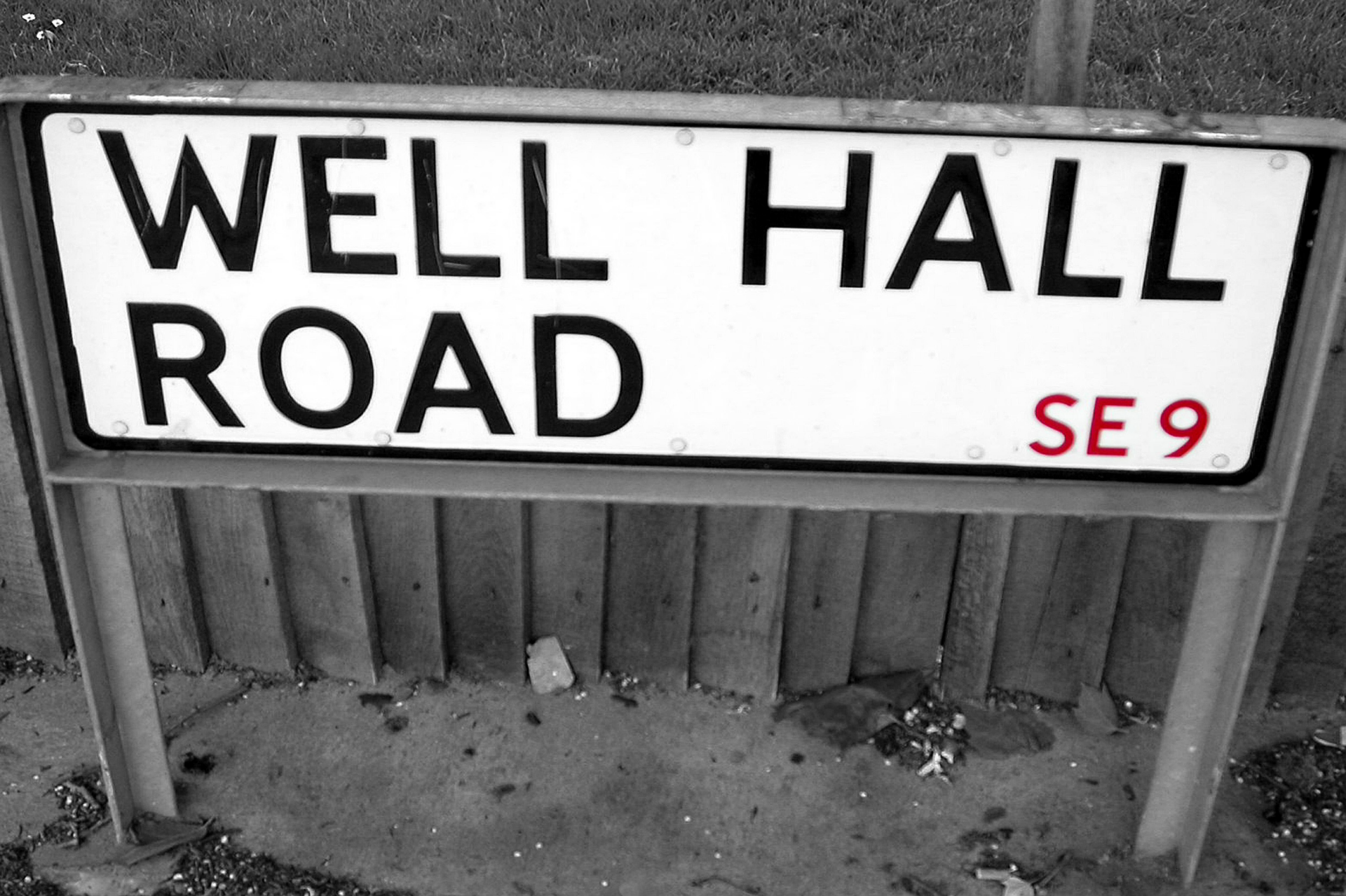
Well Hall Road photograph mounted outside installation space, near the entrance