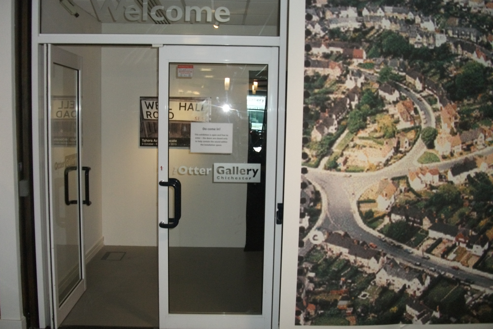
Entrance to Otter Gallery with aerial photograph of Well Hall Road