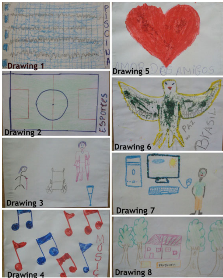
Photograph 1. Poster on the strategies to prevent violence and promote a culture of peace, elaborated in the first adolescent team.

Any Culture Circle has an assessment as its final phase, which is not mediated by classifications and grades, but by the participants' self-assessment of their experience in the teaching-learning process, focusing not only on the subjects, but also on the researcher/entertainer's activities in the Culture Circles (Monteiro, Cavalcanti, Aquino, Silva, & Lima, 2013). For this assessment activity , an open space was stimulated to make the adolescents feel at ease to discuss the experience and anything else they found interesting, while collectively constructing the knowledge. The following statements emerged: