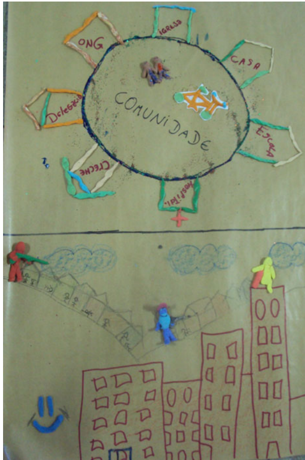
Photograph 2. Poster on the strategies to prevent violence and promote a culture of peace, elaborated in the second adolescent team.

Culture Circle (Monteiro & Vieira, 2010) and mobilising them for the construction/deconstruction/reconstruction process of reality, permitting the production of more conscious postures towards their social role.