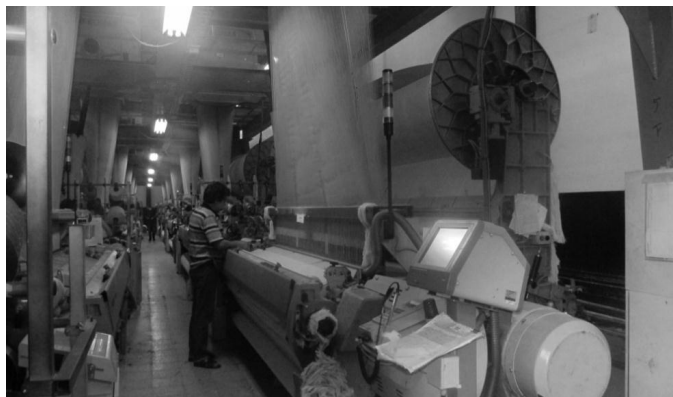
Figure 2. Shop-floor of one of the companies visited

"I conclude that this project contributed very positively to my training. Besides this, I have approached the practice of an Industrial Engineer professional and became more enlightened about the tools and fundamental characteristics that have to be learnt and developed to be successful in this area." Figure 2 shows the shop-floor of the company visited by ST16.