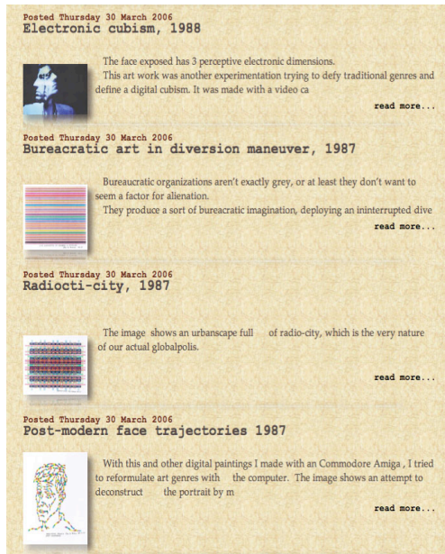
Fig. 3 Art blog index page