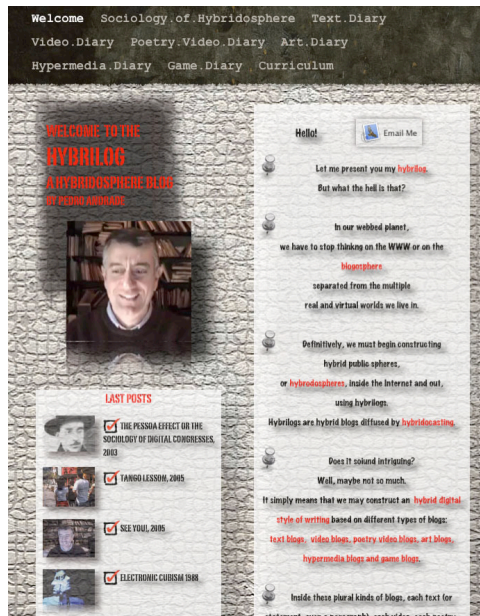
Fig. 1 Hybridlog Welcome/Home Page

Nowadays, the blog phenomenon is grounded mainly on text diaries, which are published, first of all, through textcasting , that is, periodical text diffusion by the internet. Meanwhile, blogs had engendered a multitude of descendents, for instance the vlogs (Fig.2) and the plogs . In fact, video-diaries or vlogs are transmitting messages principally through video clips instead of written words, that is, through videocasting . In my perspective, plog means ' poetry blog ', that is to say, a virtual poetic diary diffused world wide by poetrycasting . On its side, a 'poetry-video-blog' or, briefly, pvillog , as it distributes essentially videopoetry, has a mode of delivering posts that should be called videopoetry casting .