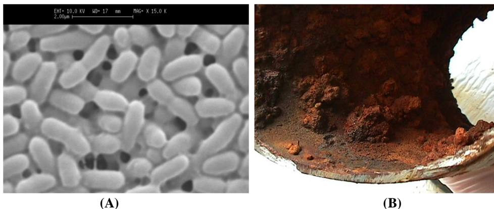
Figure 1. (a) Scanning electron microscopy (SEM) photomicrographs of 24 hours old biofilms formed by the opportunistic Gram-negative Burkholderia cepacia (isolated from laboratorial DWDS) evidencing the presence of an extracellular polymeric matrix ( \times 15000 magnification; bar = 2 \mu\text{m} ). (b) Ductile iron pipe section from a DWDS with biofilm and high amounts of corrosion products. This section of DWDS was obtained as result of a pipe break in the DWDS.

incorporated in the biofilms (Figure 1b) increasing its “mechanical strength” [7-8]. According to Characklis and Marshall [9], bacteria are generally dominant in whatever biofilm due to their high growth rates, small size, adaptation capacities and the ability to produce EPS. However, virus, protozoa, fungi and algae may also be present in DW biofilms as reported by several authors [10-14].