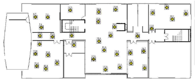
Figure 1. Calibration Points on the floor map.

The data for the experiments were collected from a WiFi indoor positioning prototype developed in our lab. The prototype consists of two main tools: Calibration tool and positioning engine. The prototype uses the Ultra-low Power WiFi module from GainSpan [13] to represent the WiFi tag sensor. Each WiFi tag sensor consists of a GS1011M (802.11b) RF Module and On-board PCB Trace Antenna type. The tag was mounted on a calibration car and connected to a laptop computer through a serial port. For the data acquisition, a developed calibration tool running on the laptop computer was used to identify the calibration points on a floor plan map representing the positioning area. The points specify the positions where the WiFi samples were to be collected. The experiments were carried out in a building that consists of two floors with multiple and different size rooms in each floor. Figure 1 shows the calibration points on the map. During the calibration phase, the developed calibration tool was configured to collect three samples of WiFi data at each point with a 2 second time interval between each two samples. Each sample consists of: a unique identifier (SampleID); a timestamp; the coordinates of the calibration point (x,y); the floor; the room; a list with the identification (BSSID) and corresponding signal level (RSSI) values of the surrounding WiFi APs. Not all of the rooms were involved in the calibration phase, as shown in Figure 1.