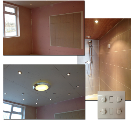
Figure 3: Visualization Suite.

In this paper we proposed a new virtual tiling service allowing, for the first time, costumers to have a high degree of confidence in visualisations of their real world settings with the virtual tiles. Our novel demonstrator will engage the users directly in the design of an environment, assuring them that their needs and expectations are satisfied within a virtual building before the design is finalised. The whole pipeline for data capturing, rendering and visualization is in place and can be demonstrated, although it still requires calibration and validation, which will be carried out through user studies.