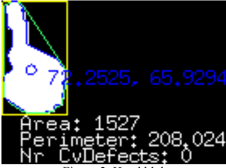
Figure 2. Hand blob