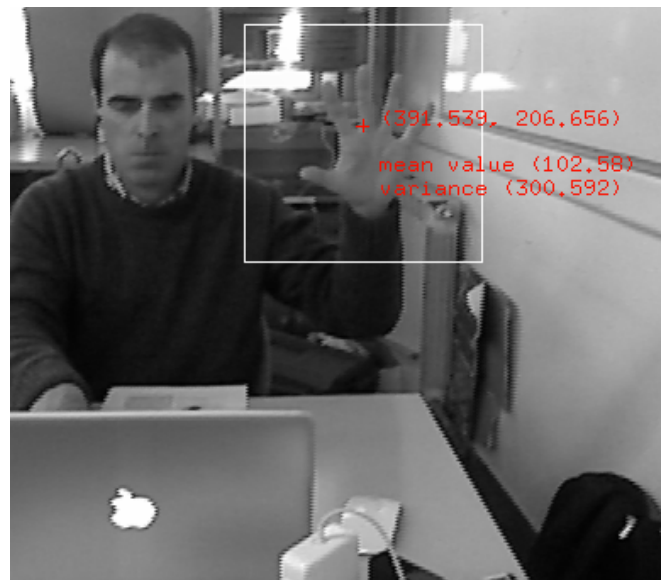
Figure 1. Detected hand with mean and variance grey values

In the present study, we used two data sets with different features extracted from the segmented hand. The hand features used for the training datasets are: the mean and variance of the grey pixel values (Figure 1), the blob area, perimeter and the number of convexity defects (Figure 2), the hand orientation, the orientation histogram (Figure 3) and the radial signature (Figure 4)