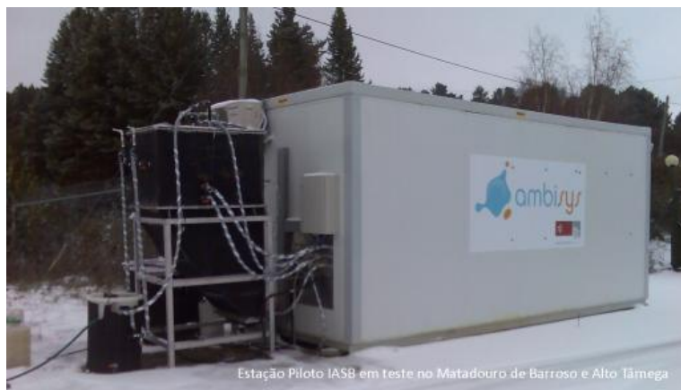
Figure 1 – Pilot-scale reactor located in Montalegre, North of Portugal.

The reactor concept was first tested at lab scale and then taken to pilot scale. A demonstration plant was operated at a slaughterhouse (Matadouro do Barroso e Alto Tâmega, Portugal) during 1 year and included a 1 m 3 reactor (Figure 1).