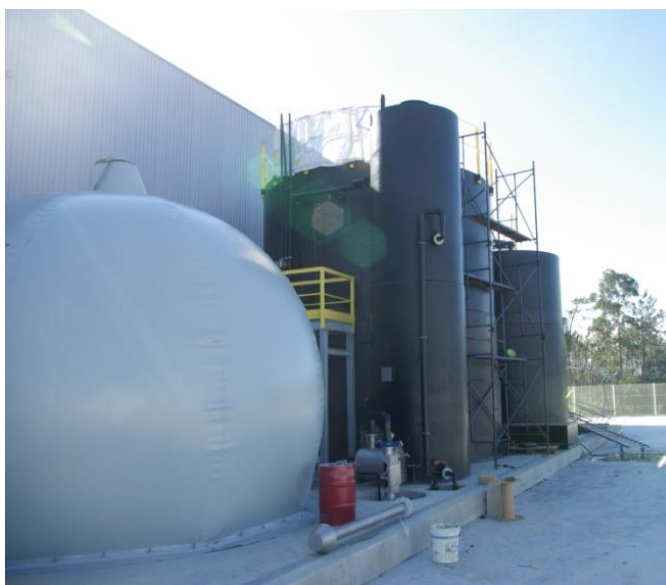
Figure 3 – Full-scale reactor located at A Poveira, Póvoa de Varzim, Portugal.

With the full-scale installation, the next step was taken in coming to fully implemented industrial application of the IASB reactor. It will give the opportunity scale up the reactor to bigger sizes using the same TPS modules and injectors.