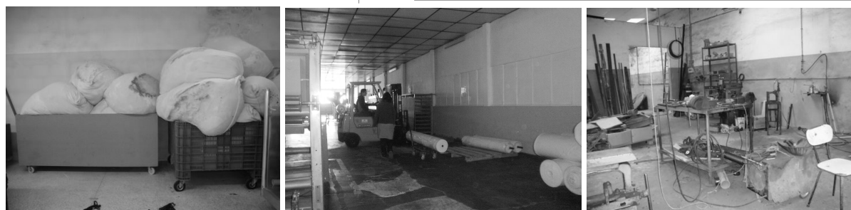
Fig. 2. Situations representing possible examples of risks

These risks can be both ergonomic and environmental, according to whether their impact is on human being health or human being health and environment (Figure 3). It can be seen that the environmental wastes include environmental risks.