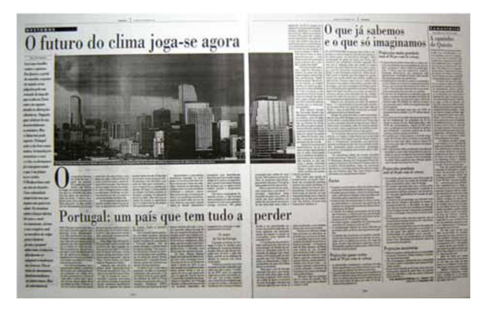
FIGURE 2: TEXTS 2-5