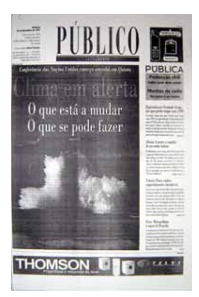
FIGURE 1: TEXT 1