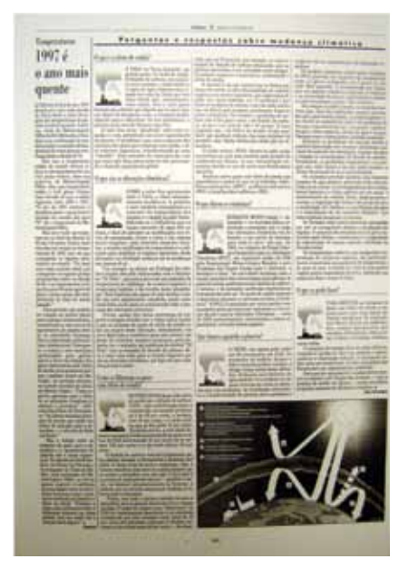
FIGURE 4: TEXTS 7 AND 8