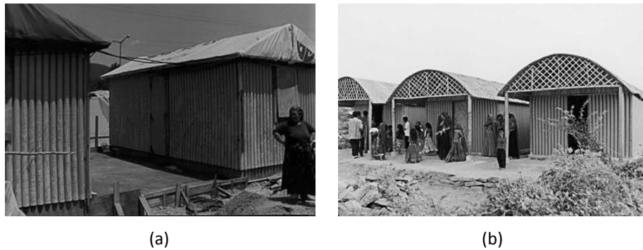
Fig. 4. Paper Log Houses: (a) works to transform two paper temporary houses into a three-room dwelling using the space between, unfortunately using concrete (Johnson, 2008), and (b) solution used in Gujarat, India ( http://www.shigerubanarchitects.com/ ).