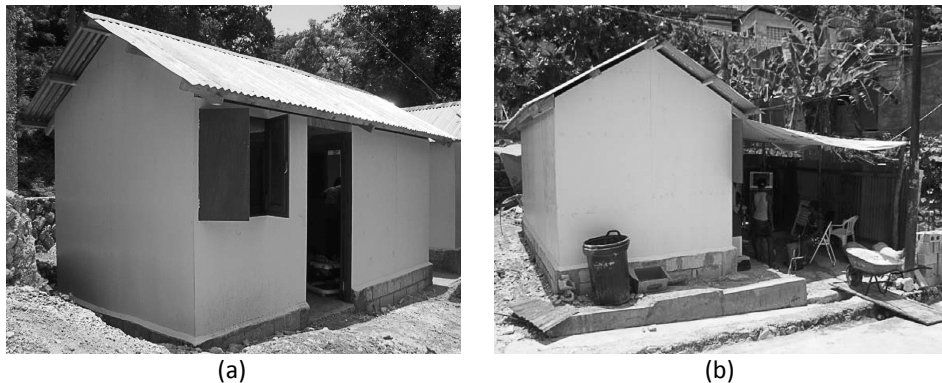
Fig. 2. IOM unit: (a) exterior aspect, and (b) after additions ( http://openarchitecturenetwork.org/ ).

The IOM unit was used in Haiti to rehouse the victims of the earthquake of 12 January 2010, and it seems to have several problems as in the previous example, see Fig. 2a. The unit is built in-situ, which means that only the materials need to be transported, and the construction systems are relatively simple. However, the foundation is made of concrete blocks under a concrete slab for the floor, and these are difficult elements to remove after dismantling. The walls are built with wood frame covered with plywood, and corrugated steel is used for the roof, but the hurricane straps are not consistently installed (Saltzman et al., 2010). It has one door and two openings, which are minimal and provide poor ventilation. This is another example of the “box-effect” (Lizarralde & Davidson, 2006) that does not address the victim’s needs. As a result, users frequently added a covered exterior area to meet their needs for space and accommodate a variety of activities. Nevertheless, the solution creates a clear gap between interior and exterior, which results in lack of integration between the original and added spaces, and also structural unsafeness, see Fig. 2b.