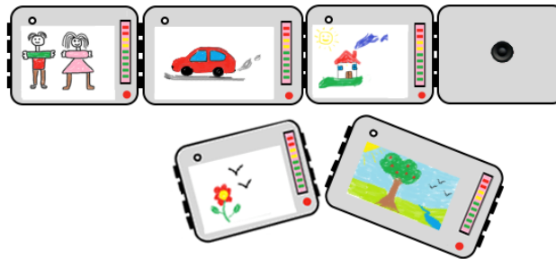
Fig. 2. Sequence with recorder-blocks and a player-block