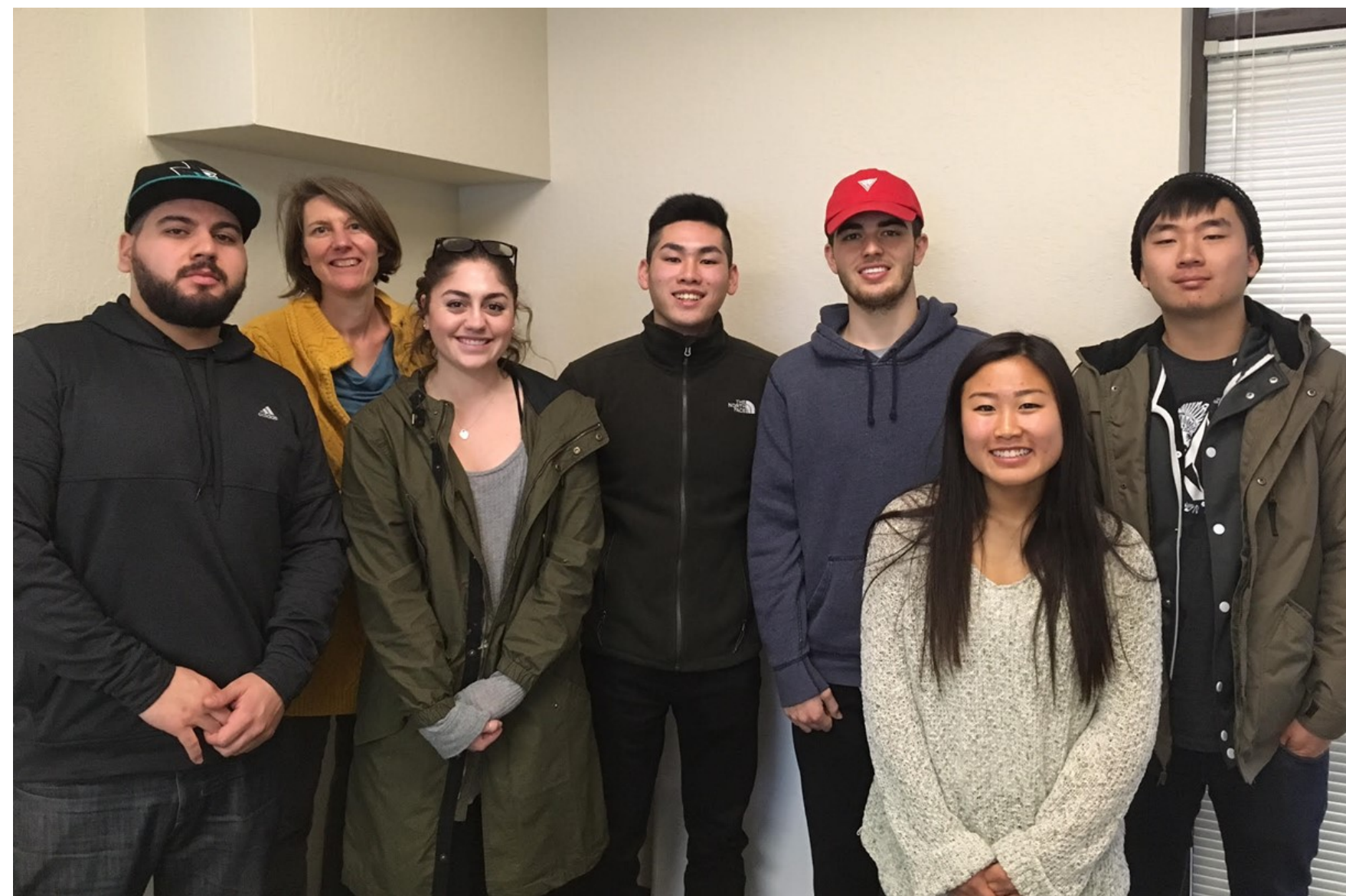
SCU students and community members were trained in Participatory Methods and are now working together on community projects.