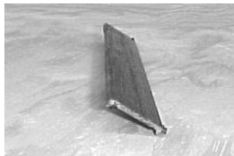
Figure 3 – U-Shape pultruded profile

The towpregs are guided into the pre-heating furnace where the material is heated up to the required temperature. In the entering zone of the pultrusion die, the material is heated up and consolidated, and then cooled down to achieve the desired shape. After reaching the solid state the material is cut into specified lengths. Figure 3 shows an U-shape profile, with a 24 \times 4 (mm) cross-section and 2 mm thickness that was produced using this technique.