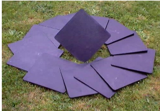
Figure 4. Long chopped fibre reinforced composite plates.

Long Fibre Thermoplastic (LFT) technology, a recent technique that allows for the production of complex shape composite structures from towpregs in very short production cycles, has also been used in the present work. With this technology a compound is obtained by mixing towpregs, cut with a desired length, at very low shear rates to retain fibre length, in a low-cost equipment. Further details on the equipment, that was developed by the Centre of Lightweight Structures (TUD-TNO, Delft, the Netherlands), can be found in reference 5. After melting and mixing the towpregs, the compound is ejected and immediately compression moulded, in a mould at 80°C and at a pressure of 200 bars, at much higher production rates than in traditional systems. Figure 4 shows some plates manufactures from GF/PP towpregs.