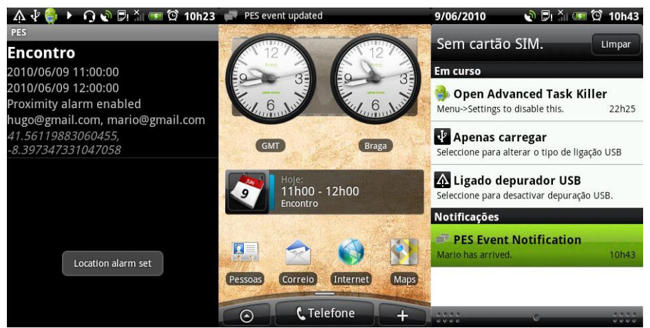
Figure 2. (a) Detailed view of an activity. (b) Statusbar notification for an activity. (c) Notifications pane with detailed description of the notification.

The following images present screenshots of the test prototype used in evaluation. In Fig. 2a we can see a detailed view of an on-going activity and its status. Fig. 2b shows the user receiving an update, Fig. 2c shows the content of the update, indicating that Mario has arrived to the activity location.