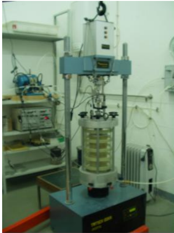
Figure 4. Triaxial equipment of Lab of Road Pavement Mechanics of the Department of Civil Engineering of the University of Coimbra

The compaction of the specimens, with 150 mm diameter and 300 mm high was executed with a vibrating hammer with the characteristics: frequency of percussion = 2750 impacts by minute, absorbed power = 750 W and diameter of compactor head = 147 mm.