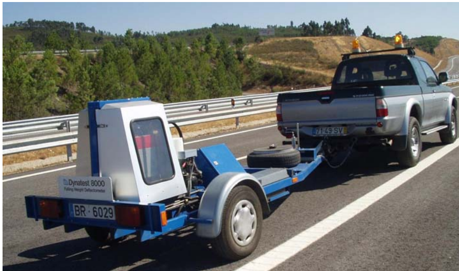
Figure 5. Falling Weight Deflectometer of Coimbra and Minho Universities

The in situ mechanical characterization was made with the Falling Weight Deflectometer of Coimbra and Minho Universities, Figure 5, and the deformability modulus obtained to the sub-base layer was, approximately, 570 MPa for the limestone and 250 MPa for the granite.