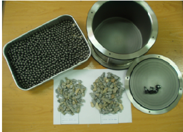
Figure 2. Micro-Deval test equipment