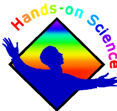
Figure 3. The "Ideas for Science Fairs" European contest is expected to involve many hundred students all over Europe.

We expect to have a positive impact in social inclusion of minorities. In particular in what concerns the gypsy community in Romania and immigrants and religious minorities in countries like Germany, Malta or Portugal. In some of our Schools there are a large increasing number of minorities that need special attention. The use of the kind of activities we propose that induces an active voluntary commitment of the students in concrete tasks can have rather positive effect contributing to a better integration of minorities in the School and in the community. Furthermore these activities lead to an organisation of the students in groups were each student will have a common appealing goal.