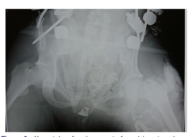
Figure 3 X-ray taken for placement of a pelvic external fixator showing: disruption of pelvic ring by the force of an antipersonnel improvised explosive device. The arrow indicates combat gauze packing a severe perineal injury; silica laden soil injection by the explosion.

In collecting information on 100 consecutive patients, we hope to have described a generalisable result. Due to the nature of the conflict and the local culture, all of the