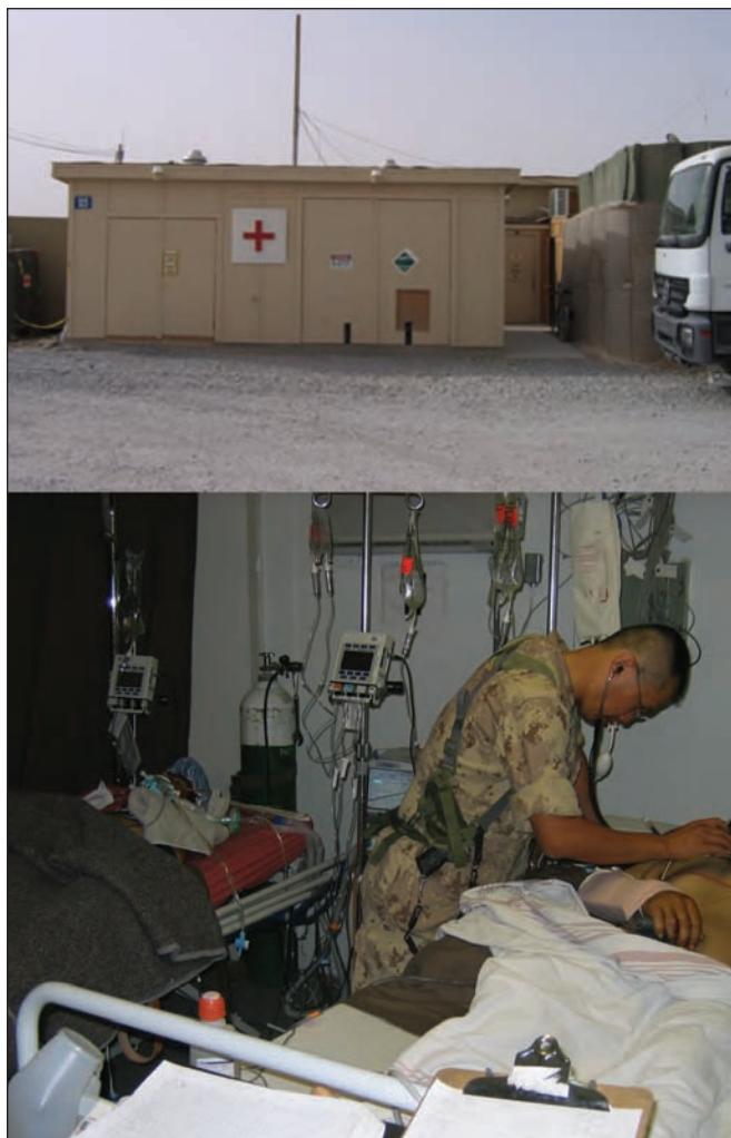
Fig. 1. The Role 3 Multinational Medical Unit facility in Kandahar, Afghanistan.

In early February 2006, Canada established the