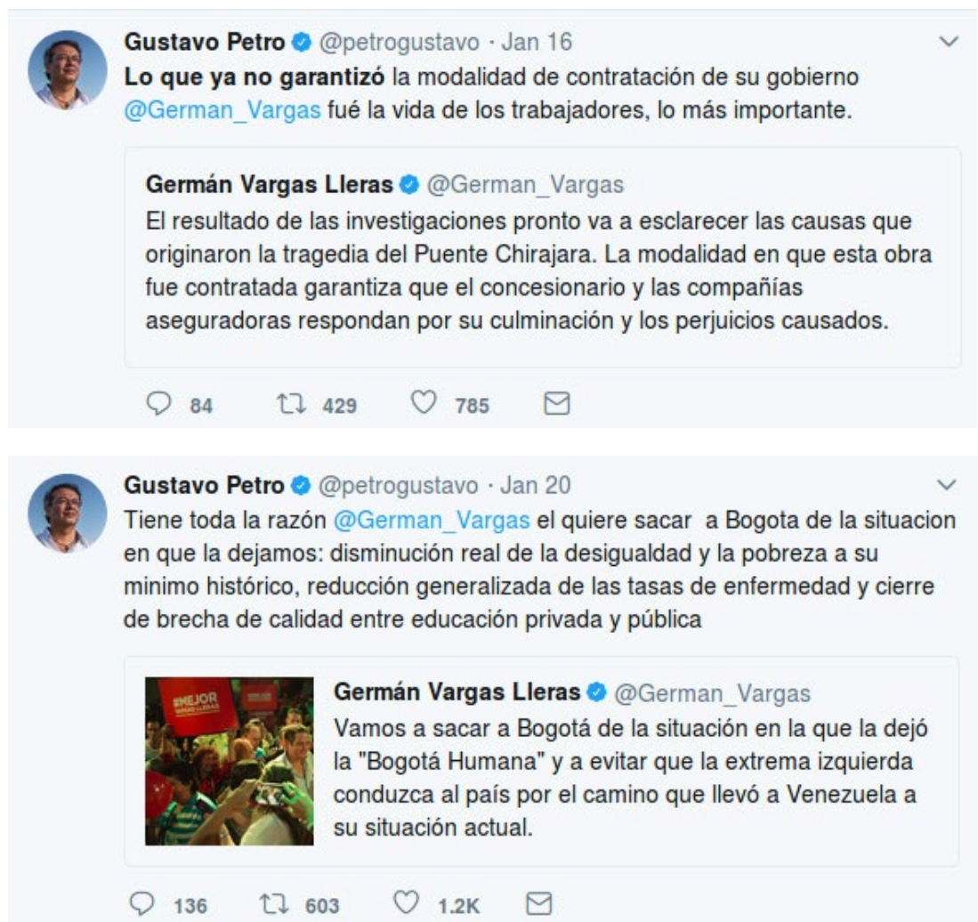
Figure 2. Some of the messages exchanged by @petrogustavo and @German_Vargas during January 2018.

Petro does not let pass the chance to engage with Vargas Lleras.