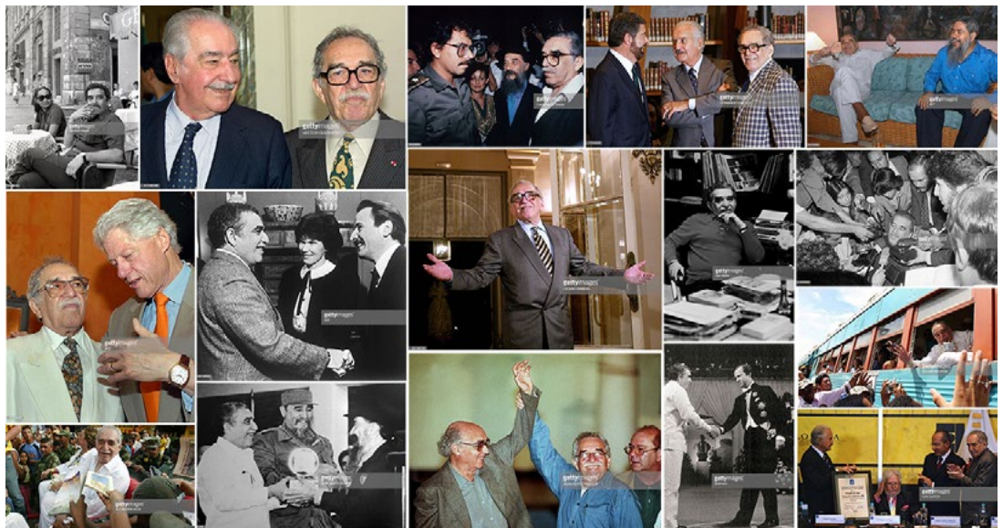
Figure 1. Composition of Gabo with different personalities 3 [ https://gettyimages.ca ]. All the credits of the images appear on the last page.

Ransom’s Center Archive shows Gabriel García Márquez photographed with more than 100 personalities from all over the world