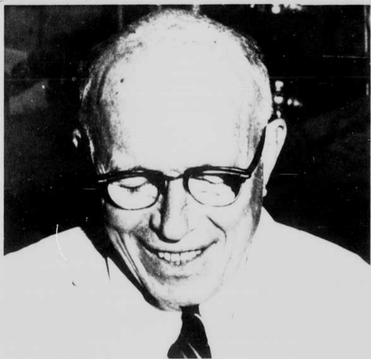
Rene Dubos, author of "So Human An Animal," and world famous environmentalist will speak at Centennial High Auditorium on February 10, at 8:00 p.m.