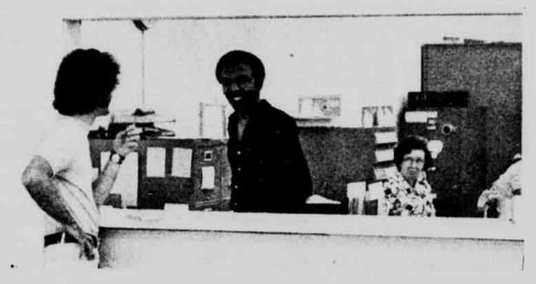
"The grill doesn't open until 2."