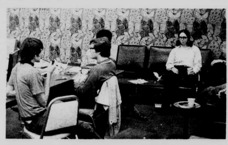
"Some guys will smoke ANYTHING."