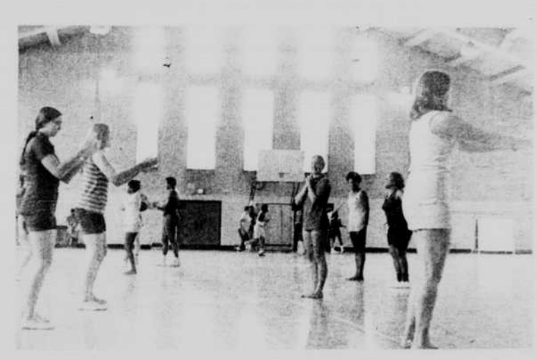
"Tomorrow I get to wear shoes."