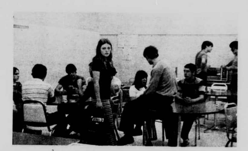
"If he'd get off the table - we could start the game."