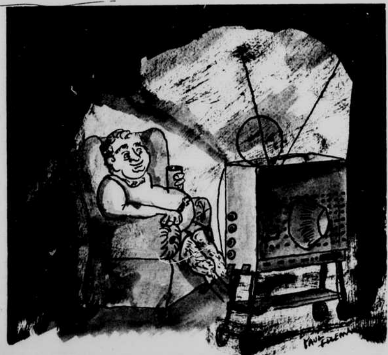
We interrupt the President's State of the Union Address to bring you tonight's game of the week.