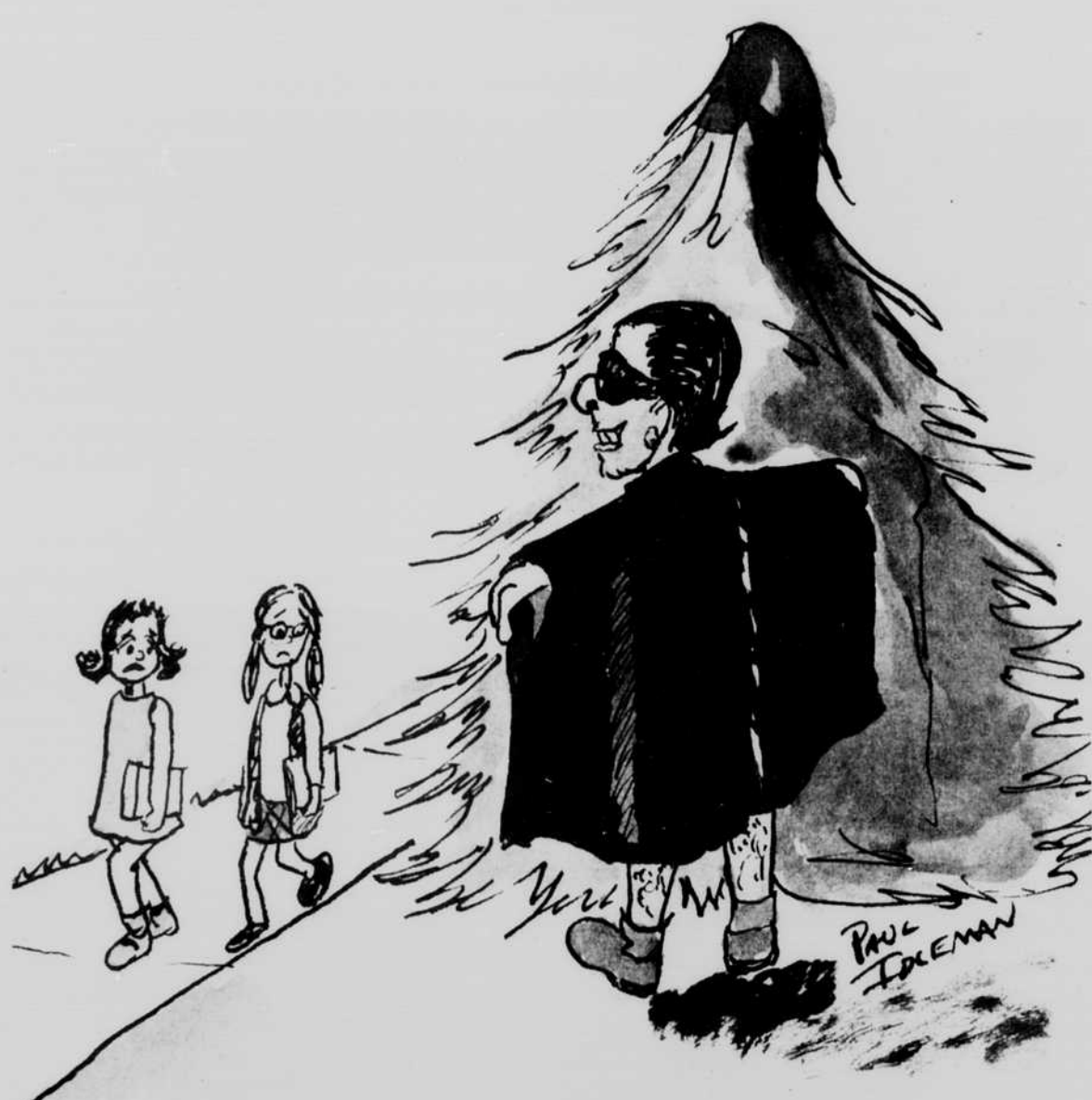
Those sex education classes sure make things easier to understand.

Starting November 2, 1971 Parkland College will have Spalding Swimming Pool open to ALL students from 11:15 a.m. to 12:30 p.m. This will be the case on each and every Tuesday thereafter. Spalding Pool is located at 910 North Harris, approximately 12 blocks from the Student Center. All students are welcome free of charge at the time indicated when presenting a Parkland I. D. Card. Other times will be arranged if sufficient interest is shown. Students must provide their own suits, towels, and hats.