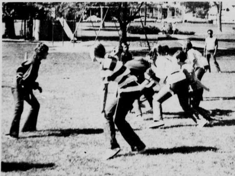
Things are rough'n tough in Powder Puff.