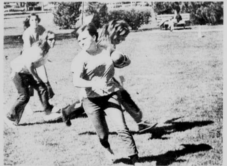
"That's really an end sweep!"

Tue., Nov. 23, Spoon River, Canton, 7:30; Wed., Dec. 1, Wabash, Mt. Carmel, 7:30; Fri., Dec. 3, Springfield, Champaign, 7:30; Sat., Dec. 4, Lincoln Trails, Champaign, 7:30; Sat., Dec. 11, Rend Lake, Mt. Vernon, 7:30; Mon., Dec. 13, Univ. of Oklahoma Frosh, Norman, Okla., 5:30; Tue., Dec. 14, Oral Roberts Frosh, Tulsa, Okla., 5:30; Dec. 20, 21, 22, Rend Lake Tournament, Mt. Vernon; Thu., Jan. 6, Spoon River, Champaign, 7:30; Sat. Jan. 8, Danville, Danville, 7:30; Mon., Dec. 13, Kankakee, Champaign, 7:30; Sat. Jan. 15, Univ. of Ill. Frosh, Assembly Hall, 5:00; Tue. Jan. 18, Lakeland, Mattoon, 7:30; Thu. Jan. 20, Springfield, Springfield, 8:00; Wed. Jan. 26, Lincoln Land, Champaign, 7:30; Fri. Jan. 28, Joliet, Champaign, 7:30; Mon. Jan. 31, Indiana State Frosh, Terre Haute, Ind. 5:00; Wed. Feb. 2, Wabash, Champaign, 7:30; Sat. Feb. 5, Kankakee, Kankakee, 7:30; Wed. Feb. 9, Lakeland, Champaign, 7:30; Fri. Feb. 11, Lincoln Land, Springfield, 7:30; Wed. Feb. 16, Danville, Champaign, 7:30; Feb. 22, 23, 24, Sectional Tournament, Olney; Mar. 3, 4, Region IV Tournament, Normal; Tue. Mar. 7, Univ. of Ill. Frosh, Assembly Hall; Mar. 14-18, N.J.C.A.A. Tournament Hutchinson, Kansas.