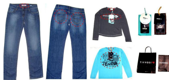
FIGURE 1. Selected garments for each gender, packaging and labelling

The odours applied on clothing and labelling (Figure 1) was strawberry and lemon scent. We also apply the less preferred odors: apple and peppermint to verify the reaction of the public target.