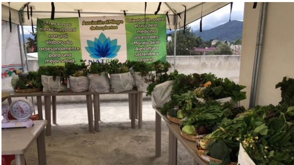
Fabio de Castro