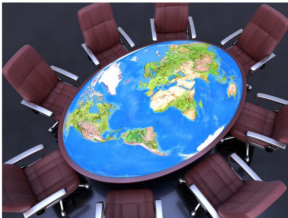
World party. ktsdesign