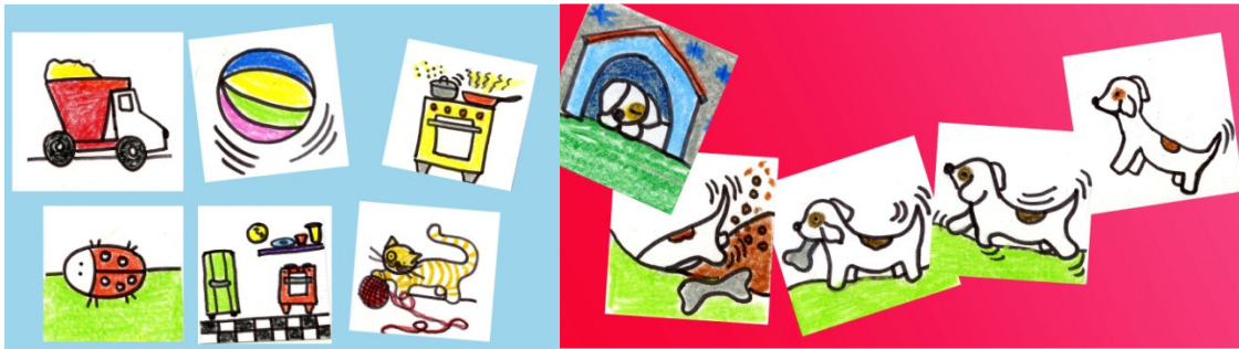
Figure 1- Examples of cards (left). Sequence of cards with the dog (right)

each one wanted to create her/ his own story; most of them asked to create more than one narrative.