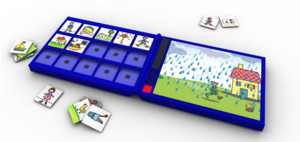
Figure 2: The platform with cards placed (left side) and the animation on the computer screen (right side).

The children can pick the cards, choosing the elements they like/need to create a story and place them on the left book page, each card over a mark. The working place comprises 15 marks, so that the children can use that amount of cards to create their story, but they do not have to use all the 15 cards, they are free to use less than that. The children can rearrange the story by changing the sequence of the cards, by adding new ones or by removing some of the ones they have used or they can simply begin a new story. When the cards are placed on the tangible left page they trigger the correspondent sound. As an example: when the card with a boy is placed the word “boy” is spoken by the system. All the sounds were recorded with the voice of a child. Simultaneously the cards that the children place appear on the computer screen embedded on the right page of the interface, showing the animated story that is being created with the cards. For instance if the children place a card showing a boy walking, on the computer screen they will see the boy moving along the screen (Fig. 2), or as another example if they place for instance the following sequence of cards: dog standing - bone - meadow - dog walking - dog with bone, on the computer screen they will see a dog running and then holding a bone (Fig. 3).