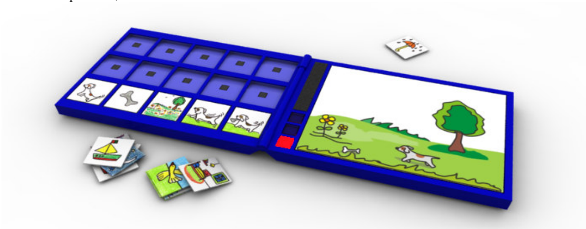
Figure 3: Scene with the dog.

When the children want to change the scene, the new one, appears on the screen, but s/he still has the previous scene on the platform, so that there is a continuous interaction between the cards and the screen.