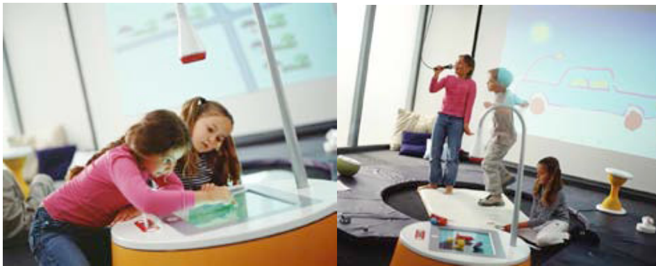
Figure 5: Children using POGO.

POGO allows children to create stories by connecting physical and virtual environments. A set of different tools provides for simultaneously capturing, manipulating and combining pictures, drawings or collages, as well as sounds (Fig. 5), (Decortis and Rizzo, 2002)