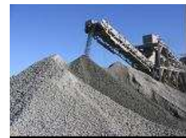
Fig. 2 Classification of the material.