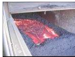
Fig. 1 Steel slag after being separated from liquid steel.

C.4: Storage and maturation by hydration to air, for the time necessary to neutralise the remaining lime.