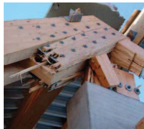
b) Rupture at the critical cross section in the corner connection