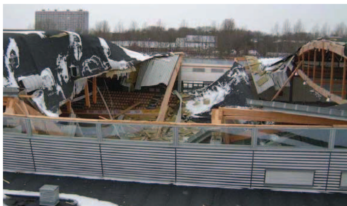
a) An intact truss is seen to the right

In the case of the Siemens Arena failure (Figure 4), the first consequence of a seismic design would have been the increase of transversal stiffness. This could have caused progressive failure, following the collapse of one truss, leading to large increase in indirect consequences of damage. In fact, the 12 m long purlins between the trusses were only moderately fastened, such that a failure of one truss should not initiate progressive collapse. As all trusses had much lower strength than required by the failure of a neighbor element, it might be fair to conclude that the extent of the collapse was not disproportionate to the cause. The result of a seismic design could have been an increase in transversal stiffness, which could have caused progressive collapse of the structure.