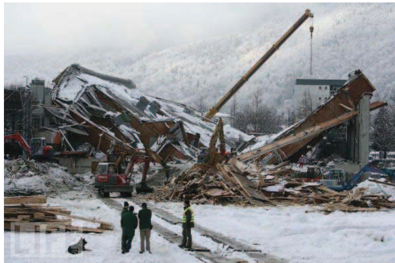
Figure 3: Bad Reichenhall ice-arena collapse

under seismic design, and no real advantage could have been obtained from considering earthquake as a load.