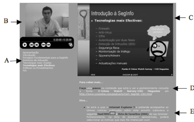
Figure 2 Streaming interface of the thematic module (in Portuguese).

A simple note explaining how to make RSS useful to the user was made available.