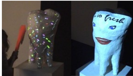
figure 2. Child interacting with the interface.

The tangible interface consists on a large physical tooth and a toothbrush both about 70cm. The virtual germs are projected on the tooth. Children interact by cleaning the germs with the toothbrush: they brush the tooth and the germs simply disappear with each pass of the brush (fig.2).