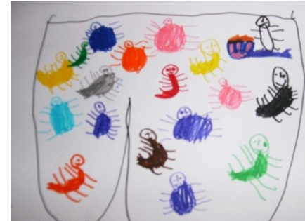
figure 7. Picture drew by a child from the control group.

A non-parametric Mann-Whitney U test for independent groups was chosen because the conditions for normal distribution of the high value of skewness weren't fully guaranteed.