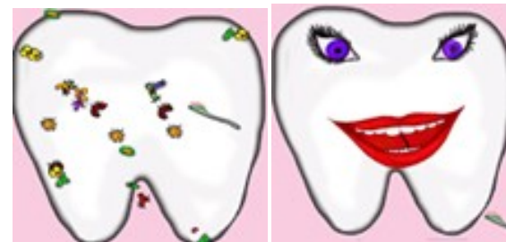
figure 1. The computer game.

Motivated by the needs of kindergarten teachers that teach children about the importance of good oral hygiene we designed a tangible interface in which one can brush away virtual germs. A study was conducted to assess if the tangible interaction provides a more engaging and enriching experience than a traditional interface by conveying the same content. Therefore we developed in parallel a computer game consisting of a tooth with germs moving on its surface, that children can clean with a toothbrush (fig. 1) by handling the mouse.