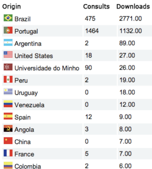
Figure 1: A screenshot of the output produced by the Statistics Add-on.

We made it possible for authors to check various types of useful statistics about their communities and their deposited information items. For example, authors were able to check how many times their deposited items had been downloaded, identify the countries from which those downloads originated and see how many people read the metadata for the items but had not downloaded the items themselves.