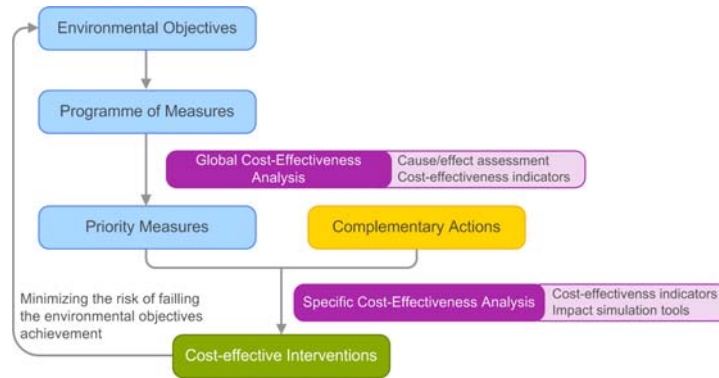
Figure 2. Cost-effectiveness analysis components

Regarding the cost-effectiveness global analysis, the aim of the methodology applied to the several measures was the definition of strategic priorities. These priorities were identified through a cause/effect matrix and a Global Effectiveness Index (EI) calculation (Figure 3 and Table 1):