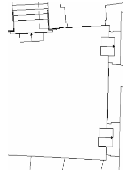
Figure 6 - Ramps to access the building.

These solutions differentiate from others by their excellent functionality, minor aesthetical impact and the better relationship between the price and the correspondent benefit. All of these selected solutions fulfil the legal requirements established by the national legislation.