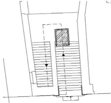
Figure 5 – Lifting platform.