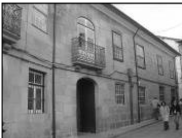
Figure 1 – East Façade of the Municipality's office for social support.

The building to which this study refers belongs today to the Municipality of Guimarães and was built in the 19th century. It was designed to be a residential building and in the beginning of the 20th century was transformed into a Police-station. Some years later, the building was transformed into an elementary school and lately became the Municipality's office for social support to handicapped persons, named Social Action Division. Figures 1 and 2 present the East and North façades of the building. As the building was not adapted to this new function, the users are having huge difficulties in accessing the services and offices that are located in the upper floors and even, in some cases, to move in the same floor due to the difference in level observed between adjacent compartments.