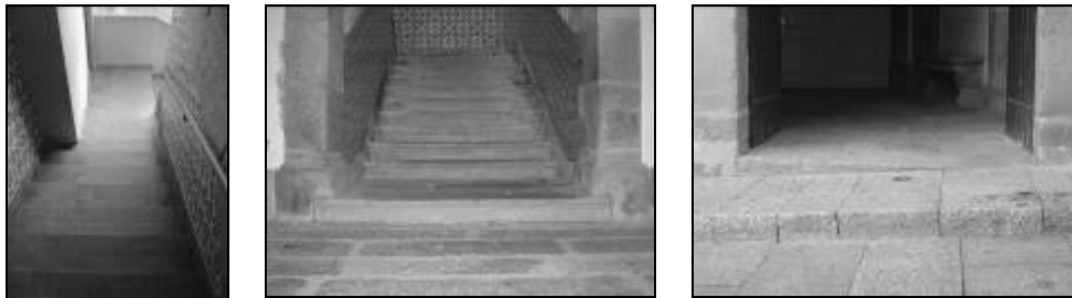
Figure 3 – Accessibility problems observed in the building.

It is important to enhance that the answer relatively to the architects and engineers sensibility about this subject of the accessibility it is unanimous: all inquired answered that does not exist care or sense when the accessibilities are created.