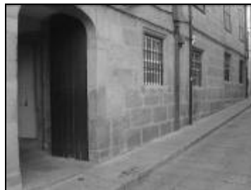
Figure 2 – North Façade of the building.