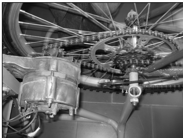
Figure 3. Car alternator linked to the rear wheel of the bicycle

Generating environment-friendly electric power while keeping fit is possible with the device presented in this paper.