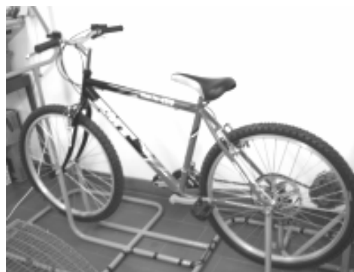
Figure 1. Electric Power Generating Bicycle

Rotating a coil within a magnetic field (Fig. 2) induces a voltage at the coil terminals [1, 2, 3], which allows powering a load connected to these terminals. If the coil rotates at constant speed within a uniform magnetic field, an AC voltage with zero mean value is induced at its terminals. The periodic change of the voltage polarity is due to the change of the position of the coil relatively to the magnetic poles. The amplitude of the voltage depends on the magnetic field strength and the rotation speed. This is the principle of operation of an alternator.