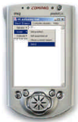
Fig. 2 – Graphical interface of the mobile unit

The J2ME defines two major categories of components: configurations and profiles [J2ME]. The components we needed were the Connected Device Configuration (the one more suited for high-end PDAs), the Foundation Profile and the Personal Profile. The first component is a vertical set of APIs that provides the base functionality, such as memory footprint and network connectivity. The rest constitute a horizontal set of high-level APIs providing access to the device capabilities ranging from I/O to Graphical User Interface.