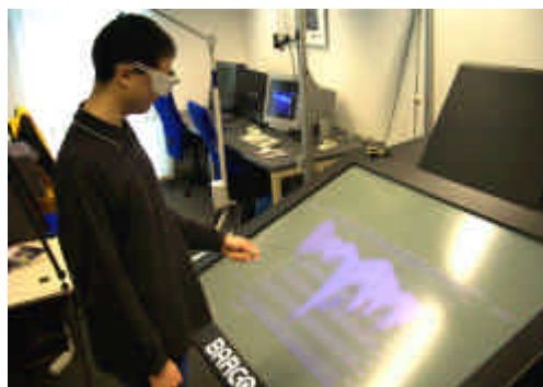
Fig. 1 – Workbench environment

“Avalon” uses the Virtual Reality Modeling Language [VRML] with some extensions as scene description language. The use of VRML has several advantages: the interface is well defined by a non-proprietary, platform and company independent standard (ISO/IEC 14772), the application developer can use a wide range of VRML modeling tools and, very important in our case, it is possible to display the same VRML file on a 2D browser on a desktop PC using 2D input devices, as well as on a VR system with 3D displays using 6D input devices. For this purpose, “Avalon” extends the concepts of the VRML “Viewpoint” and “TouchSensor” nodes: the first one still sets the global viewing direction into the scene, but the view frustum is modified according to the current head position and orientation of the user; the second node reacts on the collision of a 3D cursor with objects in the 3D scene [Sá 2002].