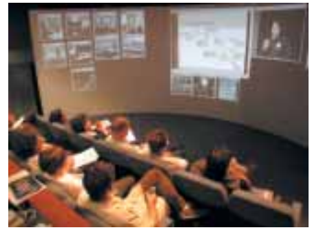
Figure 3: Example of an e-learning teaching and training room

In order to enable everyone to benefit from the easy access to the new practical forms of education through the use of the designated rooms, it will be necessary to make use of a