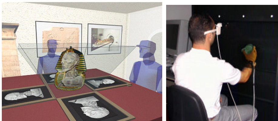
Figure.2. Left: Virtual Showcase concept; Right: Aspect of the ARK system.

ARK is being used to display archeological artifacts in collaboration with the Museum D. Diogo de Sousa in Braga, Portugal. It represents one of the next steps on the application of the technologies on cultural heritage, since it surpasses the constraints of costs and solution complexity, by encompassing a low-cost set-up and adopts a simple interface and interaction metaphor targeting the large group of the museum visitants.