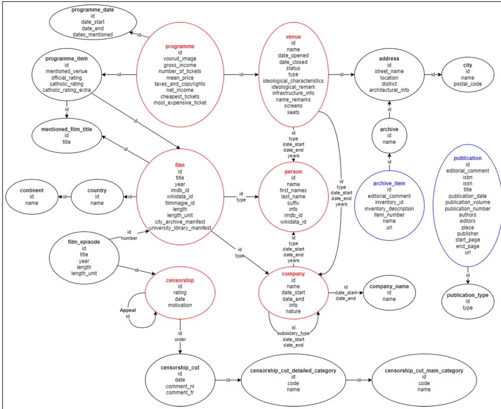
Figure 1 Simplified Entity Relationship Diagram (ERD) of the Cinema Belgica data model. The six entities highlighted in red (programme, film, censorship, venue, person and company) and two entities marked in blue (archive_item and publication) form the logical organisation of the deposited files. Most relationships from the archive_item and publication entities have been left out to prevent cluttering the diagram as these are connected to all other (highlighted) entities.