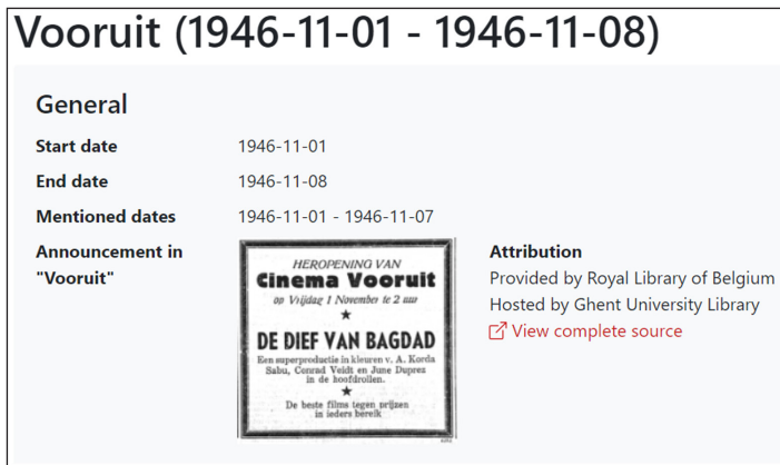
Figure 3 Thumbnail of a digitised advertisement that was the source for a programme item on Cinema Belgica. The IIIF image API links to the scan of the digitised newspaper at Ghent University Library.

Additionally, datasets were linked to digitised film heritage, such as film posters, reviews and photos. Movies were matched to Ghent University Library's and Ghent Archives' collections of historical film posters. Respectively, 215 and 788 movies were linked with their poster, providing additional metadata for the study of their historical and cultural context (e.g., R. F. Allen, 1994; Hu, 2018). Due to copyright reasons, film posters from Ghent University Library are only accessible within the Ghent University network. CB also partnered with KADOC (Documentation and Research Centre on Religion Culture and Society) to link the datasets with the Filmmagie database. 6 Between the 1930s and 2000s, the Belgian Catholic Film League collected press cuttings for films released in the country. This effort produced a documentary database of approximately 60,000 film dossiers. These dossiers are of great importance for evaluating the reception of films in Belgium as they include press releases, reviews and first images. Approximately one fifth of this collection has been linked with CB.