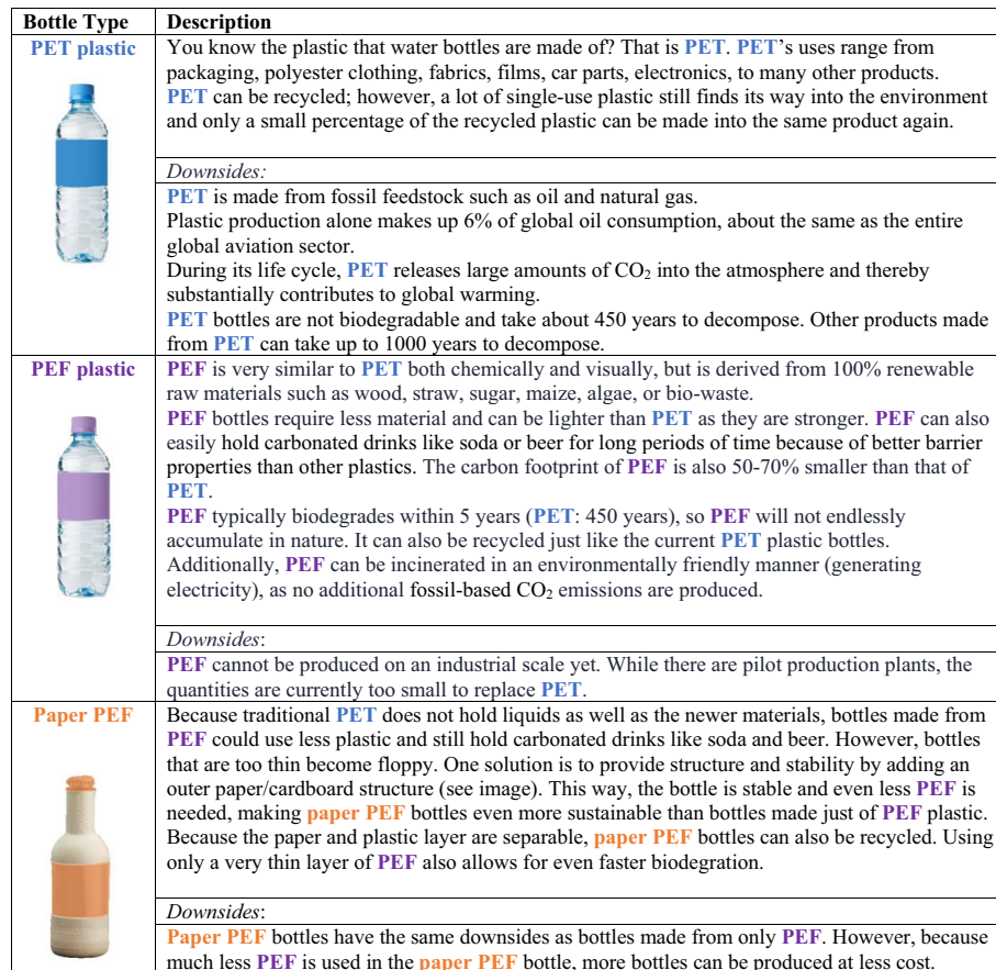
Table 1 Participants read these bottle type descriptions.

The qualitative social group responses were distilled into 29 social groups (Table 2) (see Supplement for coding process). They included both groups frequently mentioned as being important and several higher-level groups that several participants mentioned being part of but rarely made it into the first five groups they mentioned (e.g., people from your country, fellow house owners). The group