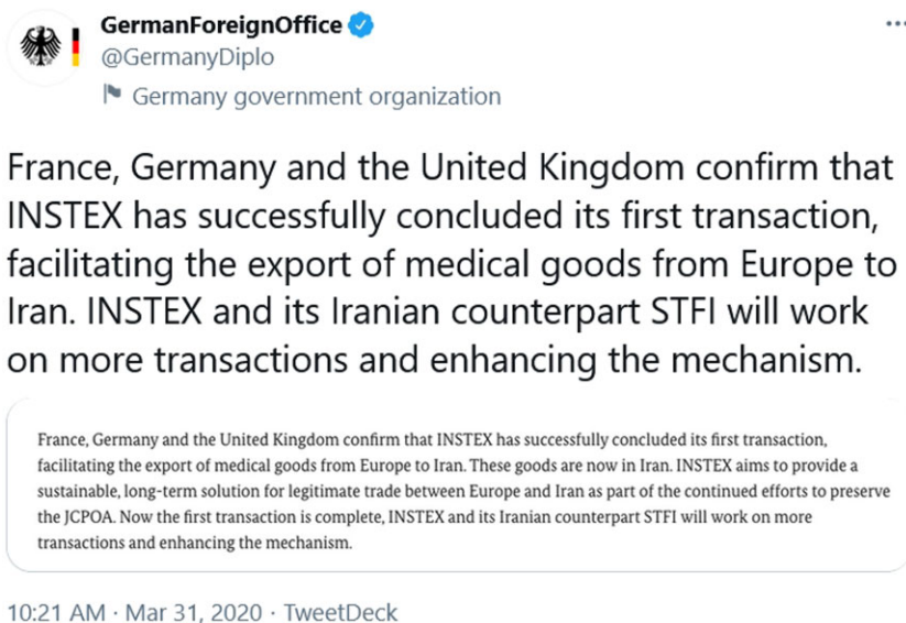
Figure 1. Tweet by German Foreign Office on the first INSTEX transaction, March 31, 2020. Source: Available at https://twitter.com/GermanyDiplo/status/1244902540812189697?s=20 .

The notion of “infrastructural geopolitics” aims to offer a framework to capture the ways in which infrastructure shapes geopolitical struggles, not simply as a tool but as an active router with agentic capacity. To this end, we develop an approach that identifies the elements of sedimentation , political resurfacing , and fracturing as key pathways through which to analyze the hegemonic politics of the contemporary payment infrastructure wars. The paper is structured as follows: we begin by engaging the current literatures on hegemony and infrastructures. Then, we outline an approach that brings the agency of infrastructures into better view. Subsequently, we analyze the contemporary payment infrastructure wars as a process of sedimentation, resurfacing and fracturing. In conclusion, we sketch the future of increasingly fragmented payment infrastructures.